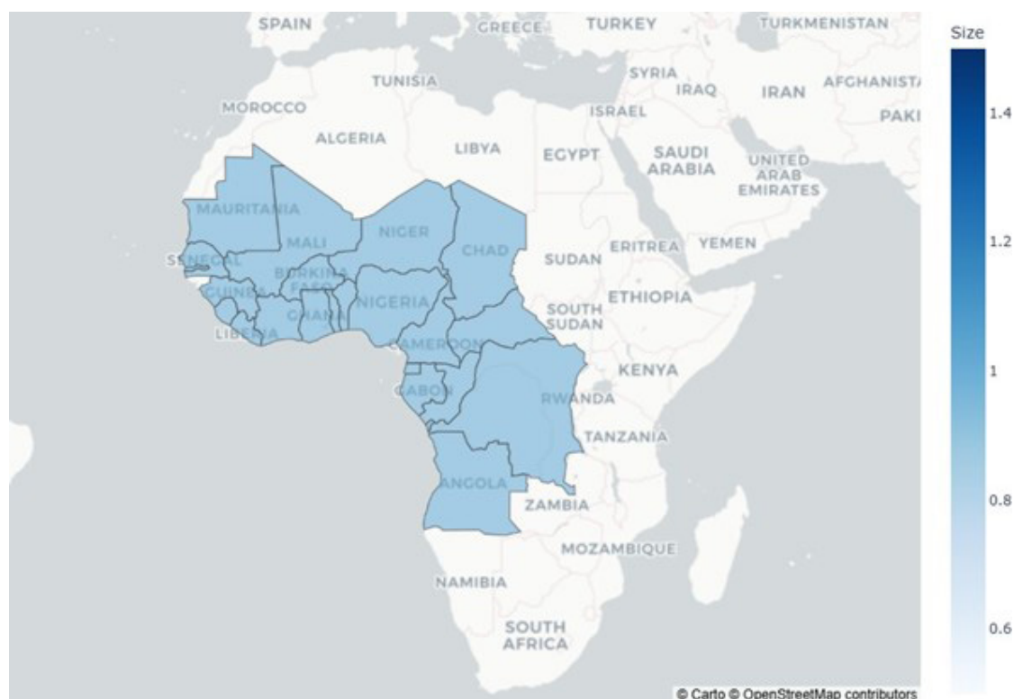
Figure 2. ABCOMICS's Regional Scope: West and Central Africa.

ABCOMICS provides a sovereign and sustainable alternative, combining a state-of-the-art bioinformatics platform with a targeted training strategy and a collaborative institutional approach tailored to African research environments.